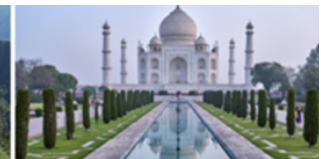
Taj Mahal (India)