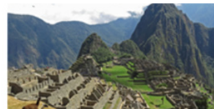
Machu Picchu (Peru)