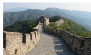
The Great Wall (China)